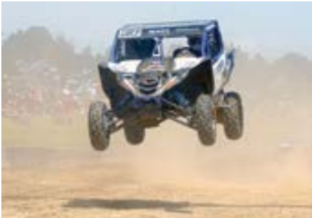
Scott racing at Counties Manukau Off Road Race Club