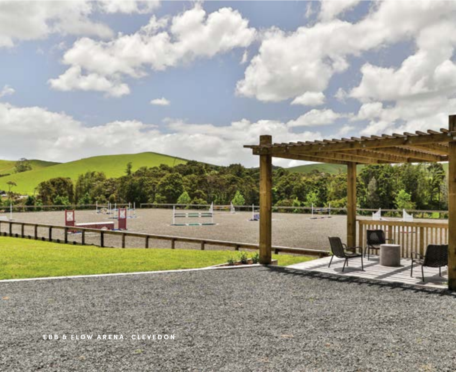
EBB & FLOW ARENA. CLEVEDON

We have spent years refining our arena construction expertise. Our construction methods are centred around achieving the right balance of compaction, binding and density in the surface blend; which we have found is the key to engineering a performance surface that is a pleasure to ride on and reduces impact and stress to joints and ligaments.